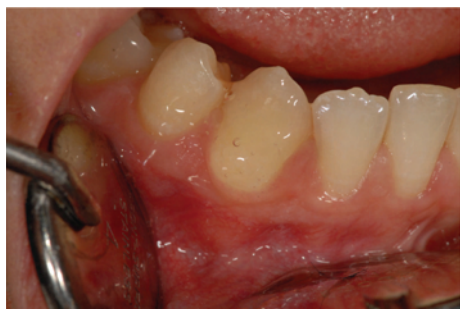
FIGURE 3: NaF gel application (Group 1).