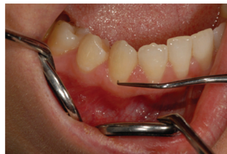
FIGURE 2: Tactile stimulus application.

cases, evolved into necrosis. Focusing on the role of laser in DH therapy, it is possible to show that its action is twofold. By one side, the low-level power lasers [14, 31], also called “soft lasers,” act directly on nerve transmission, with a depolarization process that prevents the diffusion of pain to SNC; however, their effectiveness seems poorer in higher degrees of DH. By the other side, high-power lasers such as: diode 980 nm and 808 nm, KTP 532 nm, Nd: YAG 1064 nm, CO 2 10600 nm, Er, Cr: YSGG 2780 nm, and Er: YAG 2940 nm act on DH provoking a melting effect with crystallization of dentine inorganic component and the coagulation of fluids contained into the dentinal tubules. Among these “high power” devices, diode lasers are the most studied and the ones that gave the best results in several clinical protocols even in high-grade DH cases.