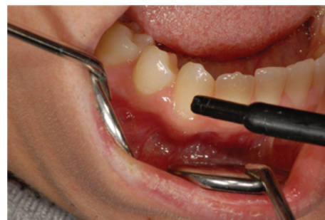
FIGURE 1: Air stimulus application.

In the last fifteen years, the introduction of lasers gave further possibilities to DH therapy [22, 26–29]. Laser photobiomodulating action in dental pulp was reported by many authors as in Villa et al. [30], with histological studies of dental pulp of mice, after laser irradiation in teeth with exposed dentine. In this study, the authors registered a large quantity of tertiary dentine production in lased teeth, that caused the physiological obliteration of tubules, while the nonirradiated control showed intense inflammatory process that, in some