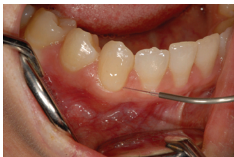
FIGURE 4: GaAlAs laser application (Group 2).

the proposed therapies (e.g., allergies to desensitizing agents) and on the presence of teeth with DH evaluated by pain response to both air and tactile stimuli that were registered by NRS scale (from 0 to 10, where 0 meant the absence of pain and 10 represented an unbearable pain and discomfort felt by the patients in their life); at last no desensitizing therapy had to be previously performed, nor analgesic drugs had to be recently assumed.