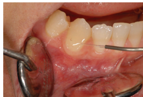
FIGURE 5: GaAlAs laser application + NaF gel application.

Patients' response to cold air blast was assessed by a short blast of 1-second duration at a distance of 0.5 cm for each tooth. Both air and tactile stimuli evaluations were performed before and after every treatment session, for a total of 3 treatment sessions at a distance of about one week each other.